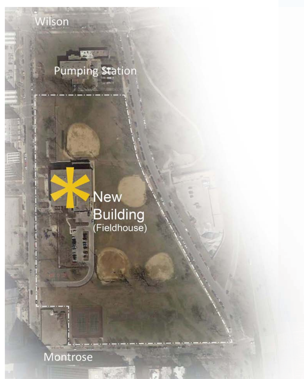
⊕ SITE DIAGRAM